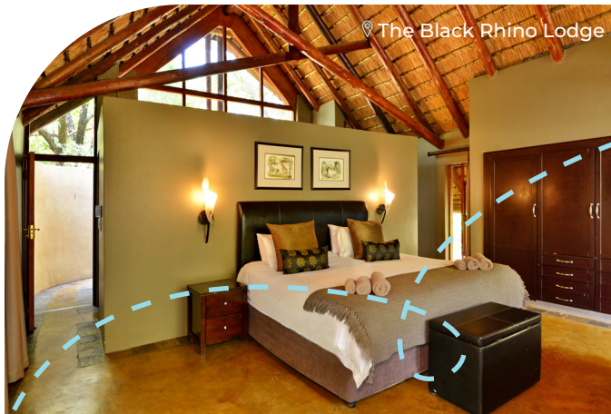
The Black Rhino Lodge