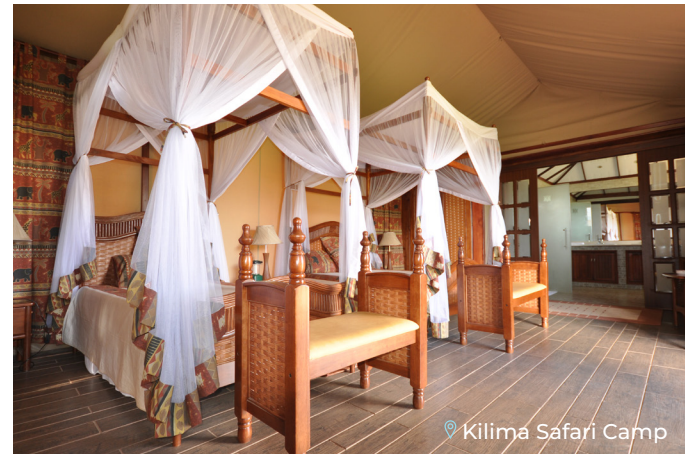
Kilima Safari Camp

Rethink your perspective about camping. Did you know that tented camps can have cozy beds, permanent roofs, and private bathrooms? And while you're among the action, perimeter fencing keeps animals away from your front door.